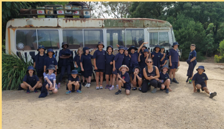
...students on fun safari adventures