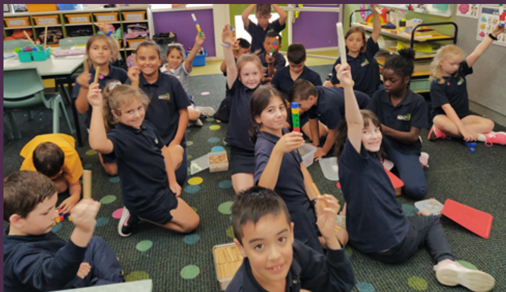
...students having fun with Place Value in Mathematics