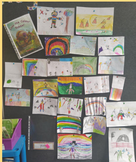
...students responding to rich texts