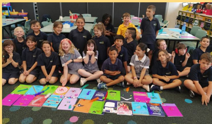
...students becoming authors