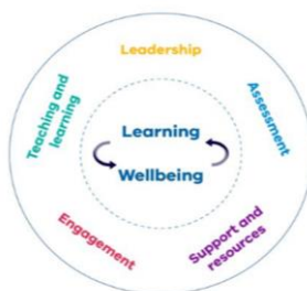
Figure 1 - The Framework for Improving Student Outcomes

The community has raised some concerns with me regarding homework . I am currently reviewing the GVPS homework policy and the Department's recommendation with school council and will communicate the school's direction on this moving forward. Research suggests that homework shouldn't exceed 20 minutes per night in primary years and should be centred around reading for enjoyment and revision of learning which has taken place in the classroom. Did you know that if your child reads just 20 minutes per night, they will know 1.8 million more words than a child that does not complete their nightly reading.