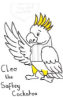
Cleo the Safety Cockatoo