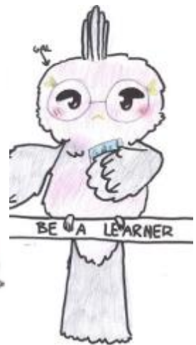
Gal the Learning Galah