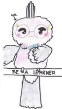
Gal the Learning Galah

As part of our curriculum, we explicitly teach the expected behaviours aligned to our school values of being respectful, being safe, being kind and a continual learner . You will see a copy of our Matrix of Expectation in this newsletter which is used to model appropriate behaviour and the language is used across the school to acknowledge appropriate behaviour and redirect inappropriate behaviour. We are in the process of updating our documentations to reflect kindness.