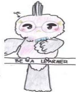
Cleo the Safety Cockatoo Gal the Learning Galah