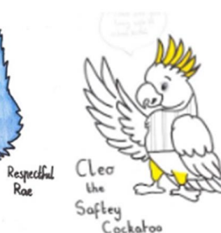
Cleo the Safety Cockatoo