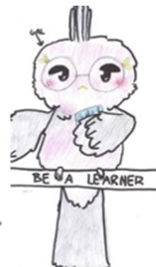
Gal the Learning Galah