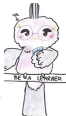
Gal the Learning Galah