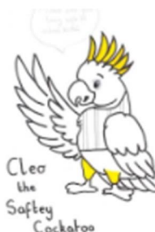
Cleo the Safety Cockatoo