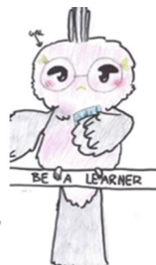
Gal the Learning Galah