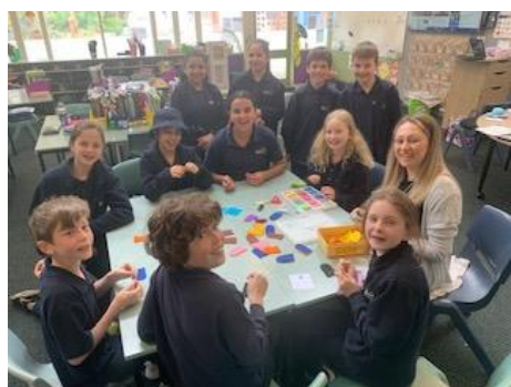
Sewing Club on Wednesdays

We have exciting lunchtime clubs running including, Lego, sewing, crafts, mindfulness and art there are many students engaging in these programs so they have a passion to explore at lunch time.